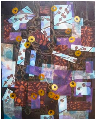
"For the Picking" 20x16, acrylic collage on canvas panel

To see more of Susan's work visit www.SusanLehmanArtist.com