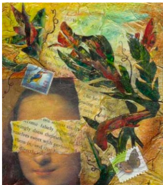
"Flowers and Their Ways" 6 x 5.25, layered tissue with heat transfer on 300# Arches